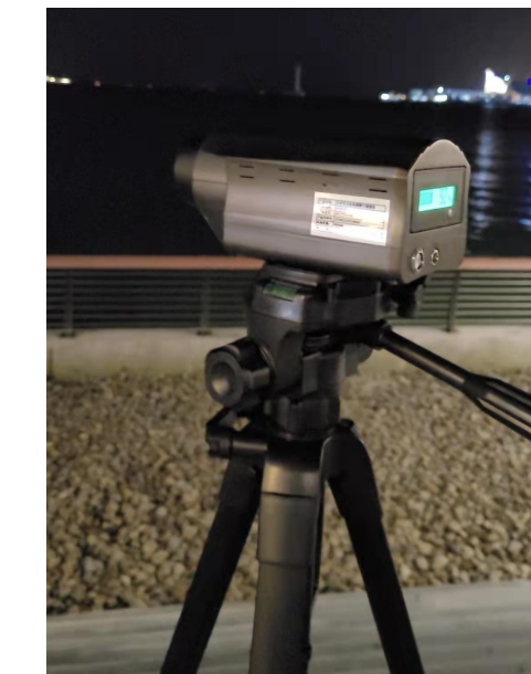
Coastal Defense Vessel Monitoring